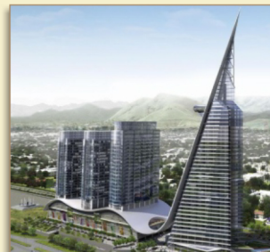
Blue Area 28 Minutes