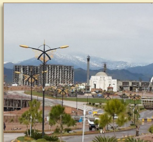
Bahria Enclave 10 Minutes