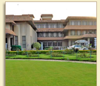
Islamabad Club 21 Minutes